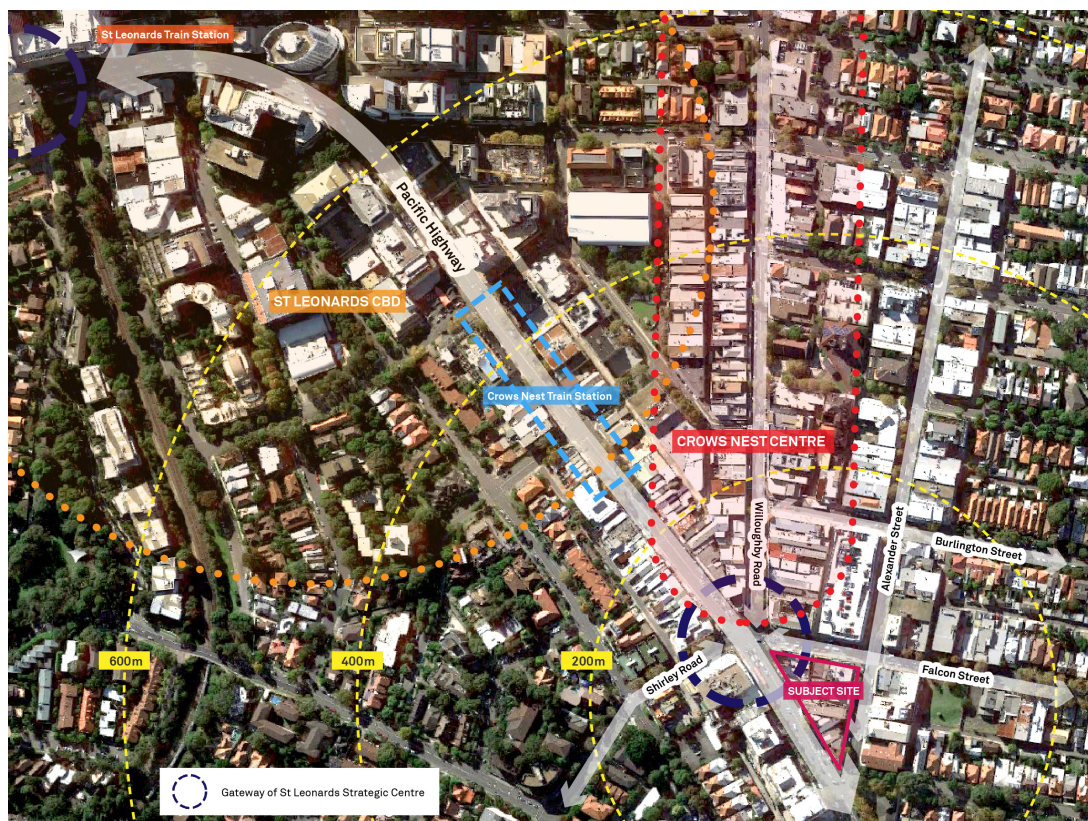
Figure 1: The site and surrounding local context

This submission to 'St Leonards and Crows Nest Station Precinct – Interim Statement and Draft Structure Plan' has been prepared on behalf of Eastern Property Alliance Pty Ltd and relates to the sites bound by Falcon Street, Alexander Street and Pacific Highway, Crows Nest (subject site), refer to the figure below.